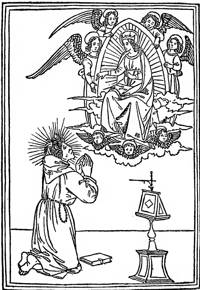
THE VIRGIN APPEARING TO JACOPONE DA TODI

From the frontispiece of Bonaccorsi's edition of the "Laude," Florence, 1490