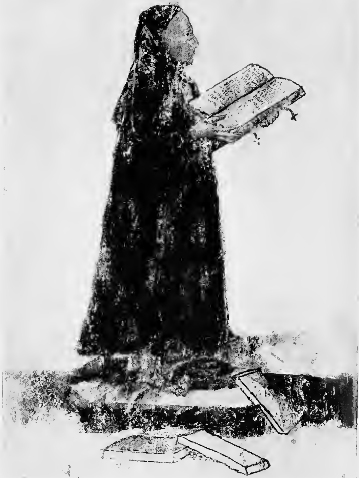
JACOPONE DA TODI

From a manuscript in the Laurentian Library, Florence